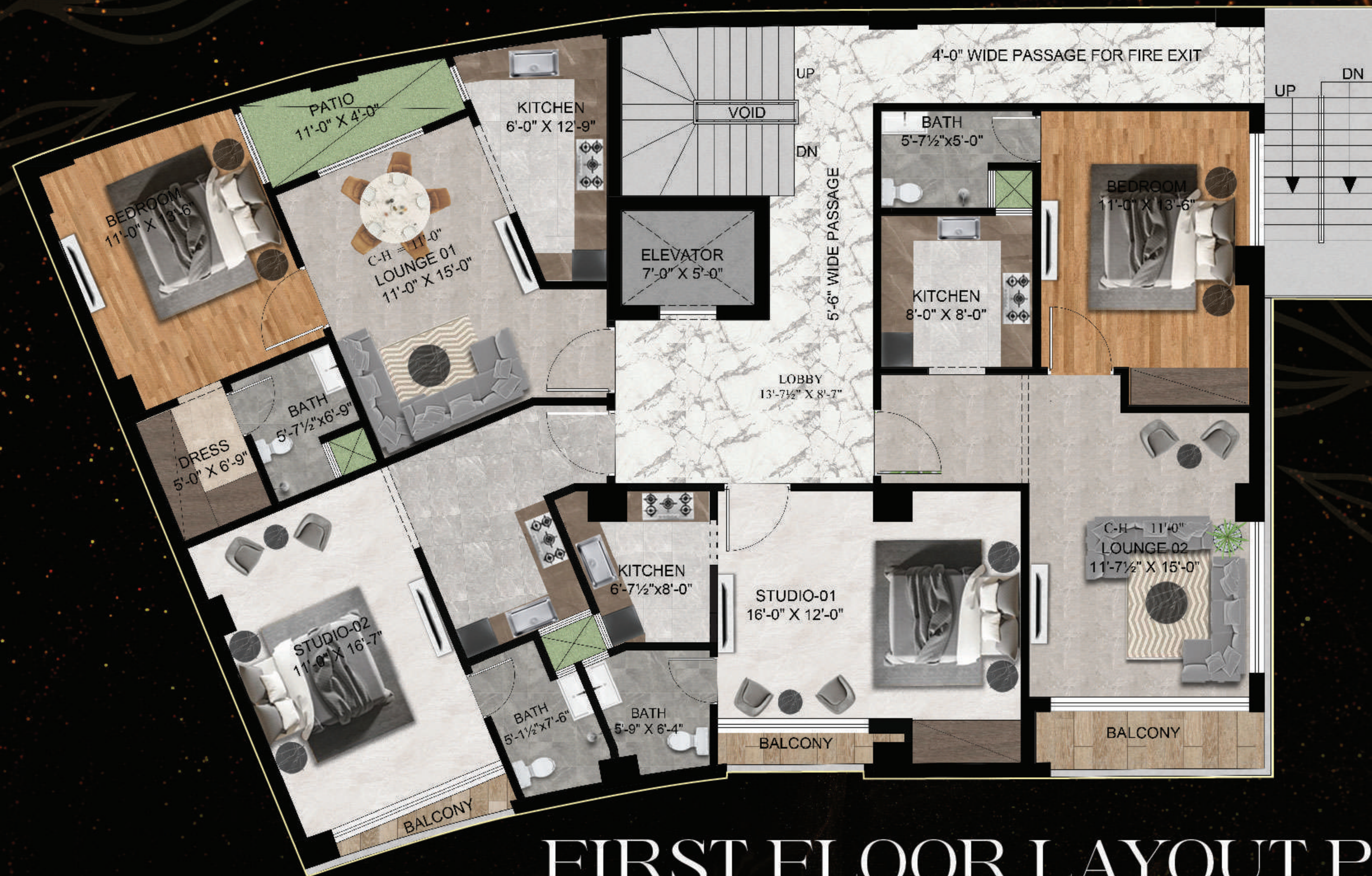
FIRST FLOOR LAYOUT PLAN