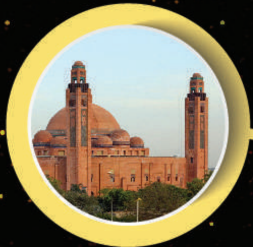
Bahria Grand Mosque