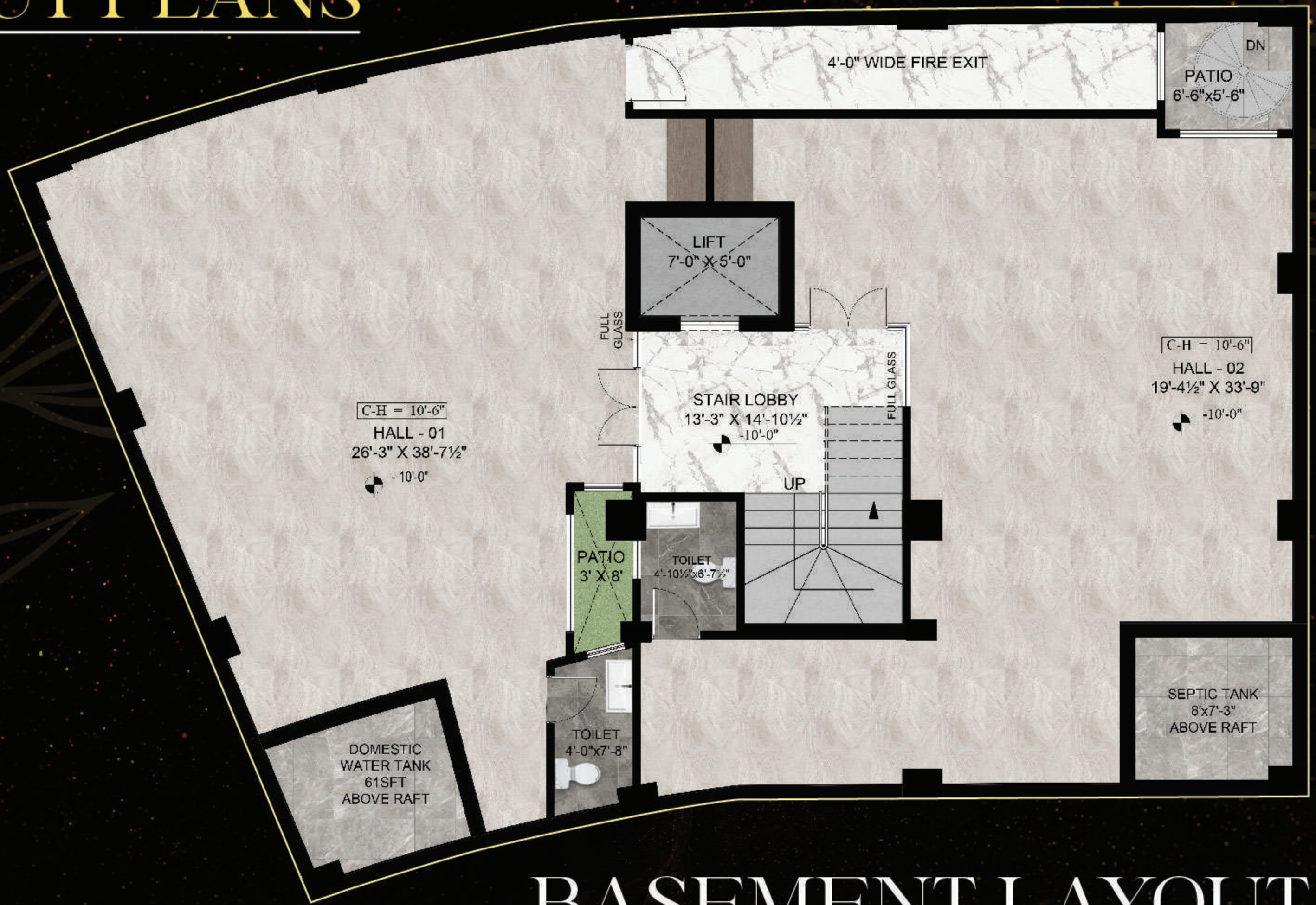
BASEMENT LAYOUT PLAN