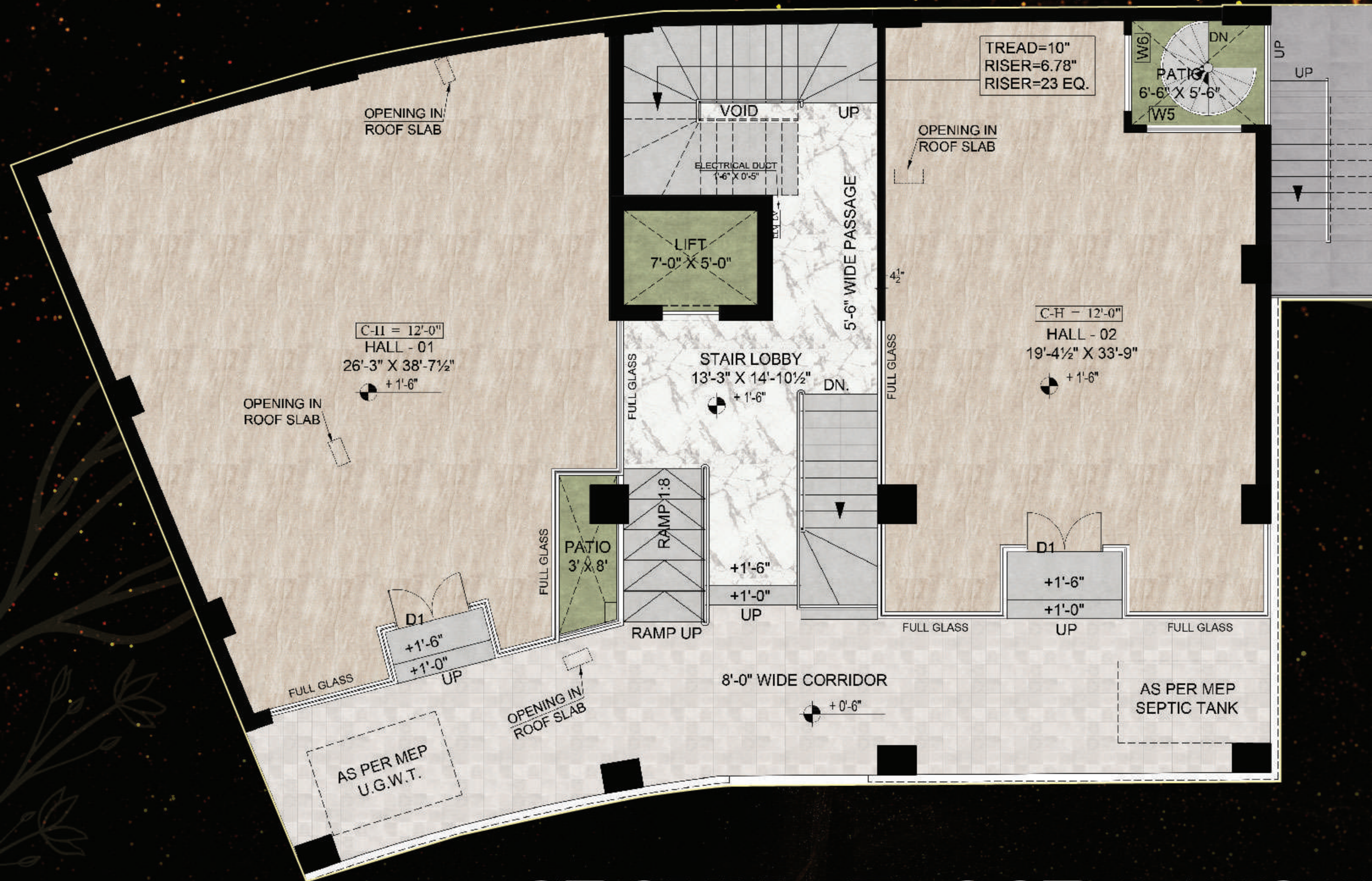
GROUND FLOOR LAYOUT PLAN