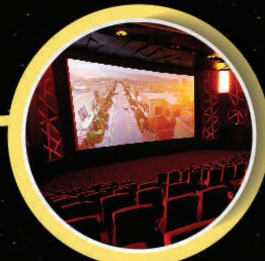
Raiha Gold Cinema